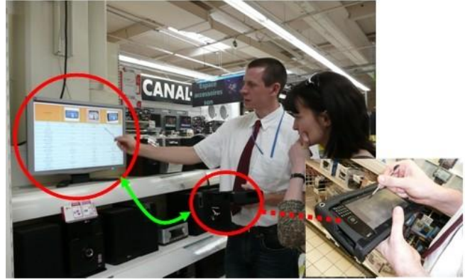
Figure 1. In store: extended interaction with assistant and screen.

A first prototype has been deployed for one month within the “nomad” department store (cameras, GPS...) of a local hypermarket, involving 4 sellers. The target products were high-end numeric cameras and GPS devices. Figure 1 shows a typical use of the prototype in store where the seller will select some products based on his discussion with the client. Then, he can share product comparison on an external screen for discussion with the client. The product features can be used as entry points towards resources either on the mobile device for the seller or on the shared screen to