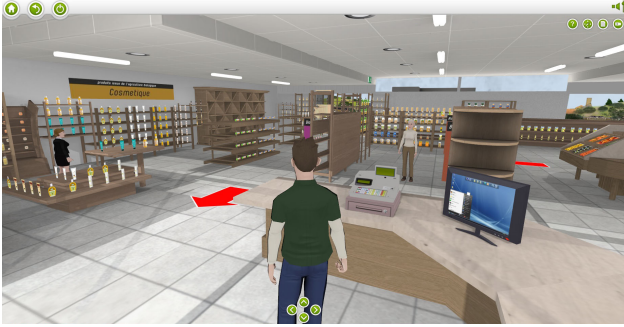
Fig. 2. FORMAT-STORE features a virtual environment populated with autonomous customers. The player can control the avatar anywhere in the store using the arrows on the keyboard or graphic controls on the screen. The environment in this figure represents a convenient grocery store. Other environments are being tested at the moment, like a larger supermarket (see figure 4).

enters a conversational mode (figure 3) where they can select propositions.