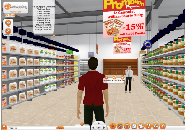
Fig. 4. Almost every object in the environment is an agent on the same account as the characters. In addition to simplifying the design process, considering every object as an agent also allows spreading the “intelligence” of the characters across the objects they interact with.

the concrete implementation of the agents. As a consequence, IODA exhibits two unique features. Firstly, the interactions can be represented independently from the agents, as libraries of interactions for instance. Interactions are reusable from one agent family to another and from one simulation to another. They can be allocated to agents in a plug and play fashion. The other advantage of interactions reification is the ability for all the agents to be processed by a generic engine through a single iteration loop, irrespective of the nature of each agent.