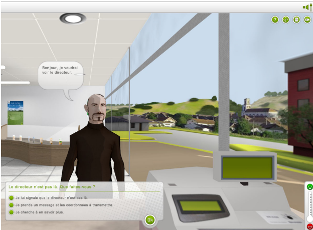
Fig. 3. Conversational interactions in FORMAT-STORE offer a specific GUI and allow the player to select a proposition among several possible. Although customers are autonomous adaptive agents, their behaviour are scripted during a dialogue.

enters a conversational mode (figure 3) where they can select propositions.