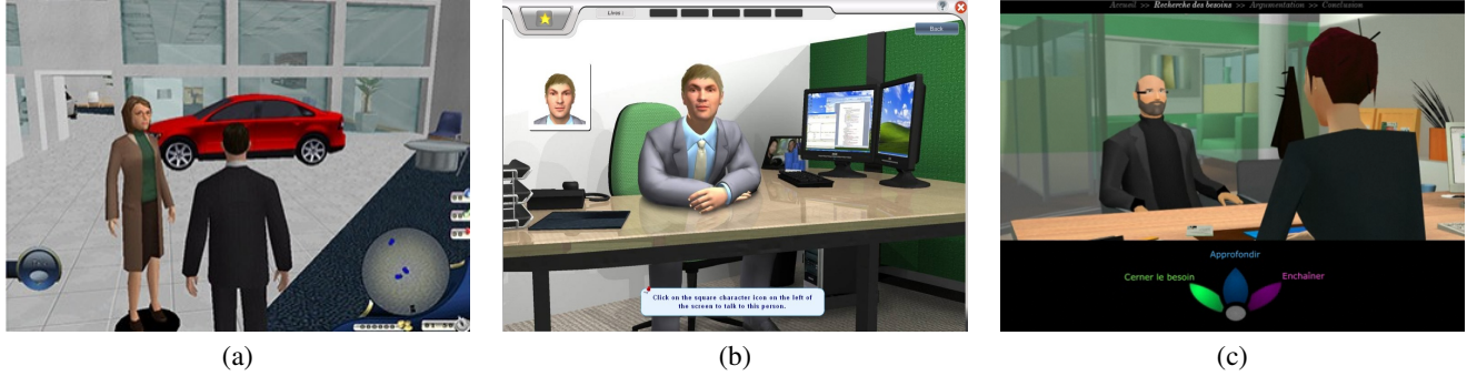
Fig. 1. (a) “Knowledge Drive” from Caspian Learning replicates the experience of an actual car showroom where the learner builds a line of argument to eventually close the deal. (b) The “Sales Game” from PIXELearning broadens the activity of the learner by enabling them to manage a professional network or a customer database. (c) The “BCV bank” project trains advisors to argue with scripted customers about financial products and bank services.

appropriate presentation by ruling out the irrelevant arguments from an initial argumentation. Law breaking scenarios are introduced in the argumentation; they must be identified and discarded by the learner.